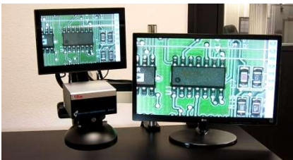
Dual screen output with an HDMI splitter (not included)

The use of a digital microscope is becoming essential as the components gets smaller to accommodate more parts on a PCB surface. The new digital microscope enables users to improve quality and increase output efficiency while being ergonomic. The DM-S7 is ideal for first article inspections, all electronic printed circuit board inspections, CNC industrial applications, medical, and aerospace applications. Every aspect of use has been taken into account during the design process, providing an effortless user experience across all industries and increased user comfort. The DM-S7 includes the 10.1 Capacitive Touch Screen high resolution display, sturdy articulating arm, diffused dome light, and 8GB USB thumb drive.